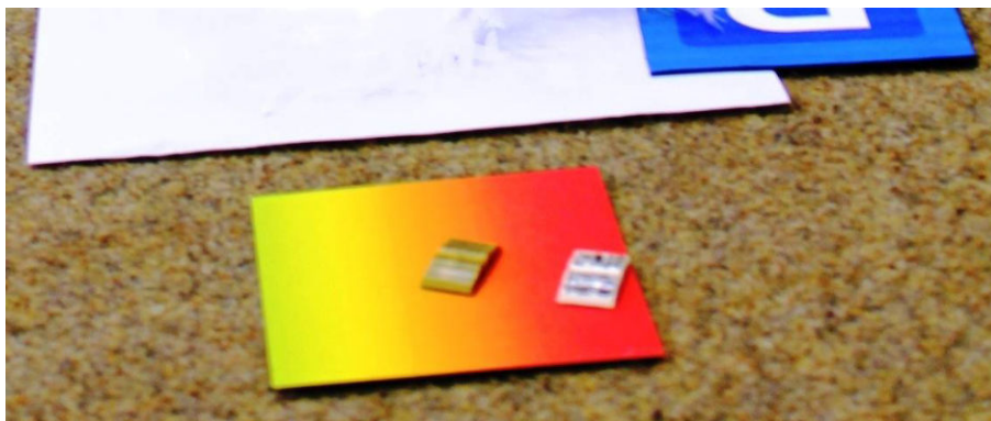
Figure 2: Colourful Card for the symbol of the aim

At the front of the pathway, the guidance officer places two sheets: