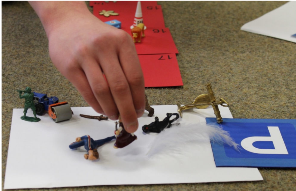
Figure 5: “Parking” of Symbols at the parking lot

The following steps of the intervention are optional, and the practitioner has to decide situationally