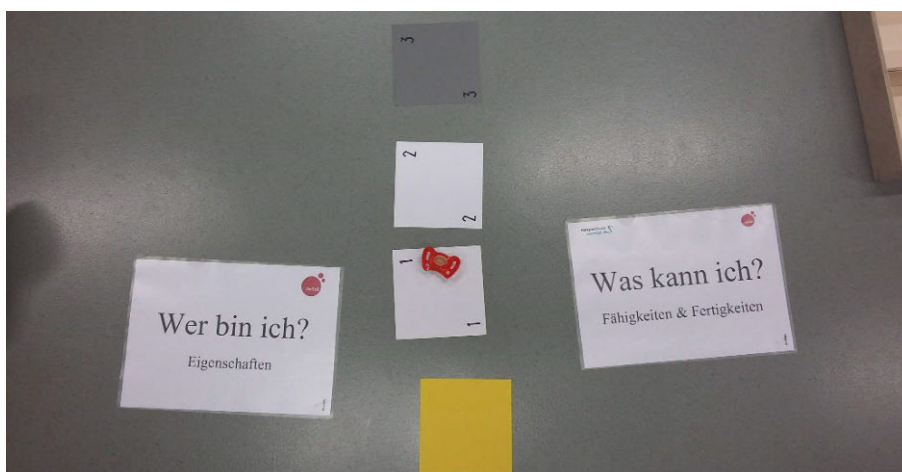
Figure 3: instruction sheets “Who am I?” and “What am I good in?”