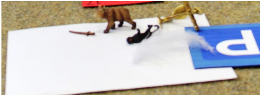
Figure 6: “parking” resources and competences at the parking slot

White paper with parking sign between the goal and the last life year: You should put all symbols there, which you consider as a strength / resource to reach your goals. Please explain them.